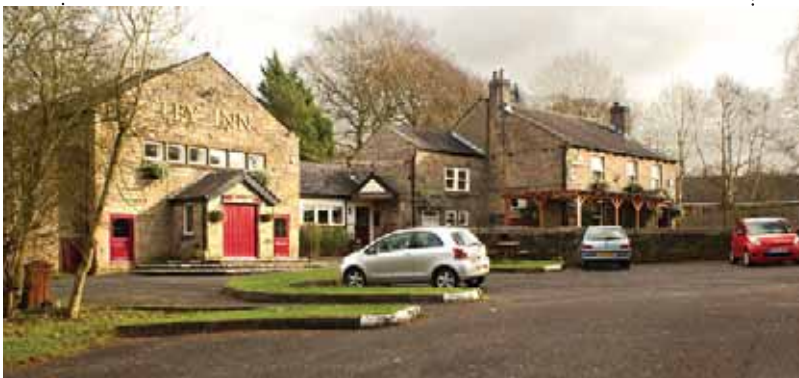
LEY INN